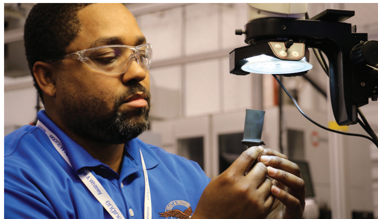
▲ Photography (3): Courtesy of Pratt & Whitney